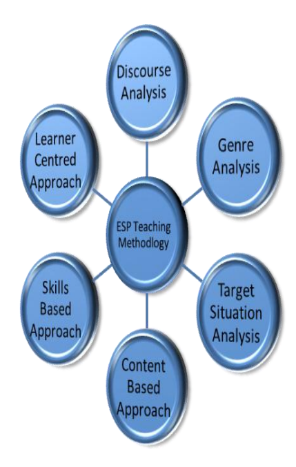
Figure 1. ESP Teaching Methodology

As a matter of fact, ESP teachers as decision -makers need 'to leave consideration of appropriate methodology out of account' Widdowson (1983). Their focus should be placed on the following three parameters